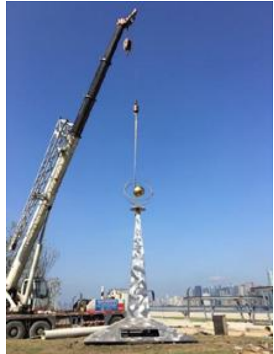
Installation of The World in Balance