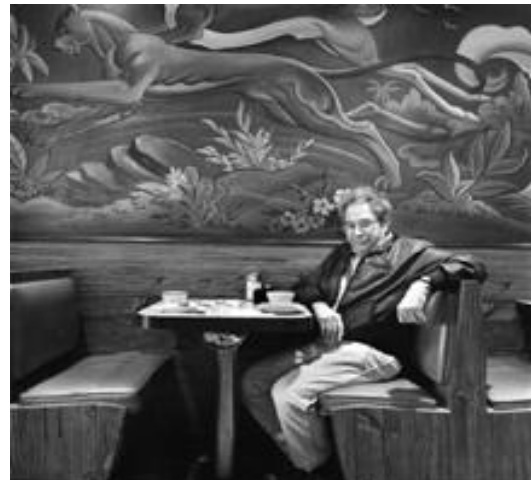
George Segal, Trenton NJ, 1987 Photo by Donald Lokuta