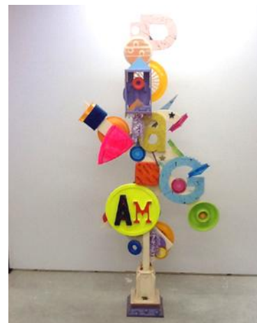
Pecan pie Jack Knight