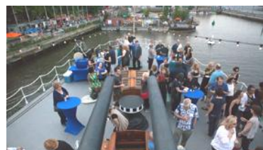
Artship Olympia Opening

Now that Artship Olympia is over I will retreat back into that life of parenting full time. Though throughout the process I have been reminded to always try to find the common threads of humanity between people (because they are there). I really do see the Olympia with new eyes! She is a National Treasure with a lofty resume, but over the course of becoming Artship , she also became a respite for a new community. She welcomed all sorts onto her decks and there we all became a little closer; inspired by history, bound by art, and changed by a willingness to connect, simply, where we could.