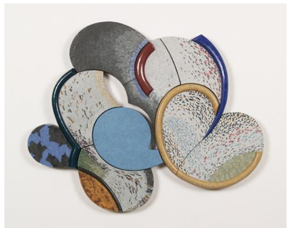
"Untitled 1213" Ken Vavrek