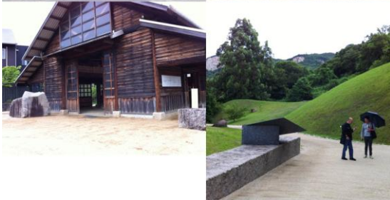
Noguchi’s Garden Museum

In addition to our exhibitions and lectures, we were able to travel and discuss art and have fun with Japanese artist friends. Highlights of the experience include a visit to Noguchi’s studio, Garden Museum and home in Takamatsu. A Ferry ride the following day to Naoshima, which is an art island located in the Seto Inland Sea, brought us through scenery that felt as though we were traveling through beautiful Japanese seascape paintings. Naoshima is spectacular. The island’s art museums were designed and built by architect Tadao Ando, and are intended to showcase the art and reflect the landscape. For example, the Chichu Art Museum is built entirely underground to ensure that it does not disturb the scenery. Shafts of light become design elements. We’ve heard it said that art should either “Change your mind or break your heart”. The architecture and landscape in Naoshima did both for us.