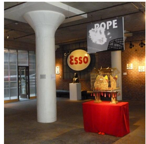
Pope Up at Globe Dye Works

Most recently, in September we organized "Pope Up," (see page 3) an artistic response to the visit of Pope Francis to Philadelphia. Globe Development Group once again allowed us to populate the ever -intriguing Globe Dye Works with our art. As everyone knows, there were many pope-related objects for sale everywhere, but we were the only fine art show that saw the visit as an opportunity for artists to make thoughtful (as well as funny and acerbic) statements about this historic event.