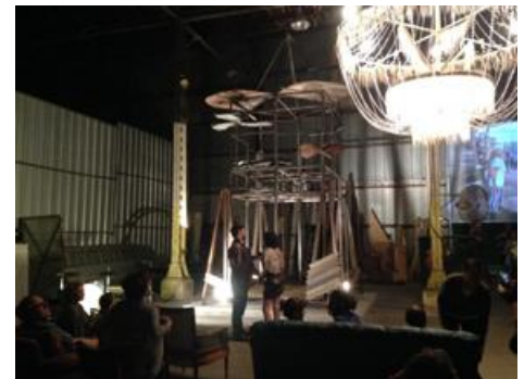
New Orleans Airlift Performance

The International Sculpture Center held its 2014 conference, “Sculpture, Culture and Community”, in New Orleans last October. The action-packed 4 days included an opening night party at the Ogden Museum of Southern Art, thought provoking panels, a trip to Xavier University and a casting demonstration, trips to artists’ private homes and studios, and a reception at the New Orleans Museum of Art and the Sydney and Walda Besthoff Sculpture Garden.