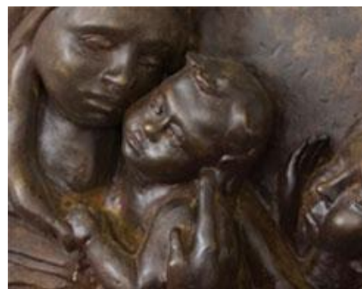
"Unconditional" by Christiane Casella