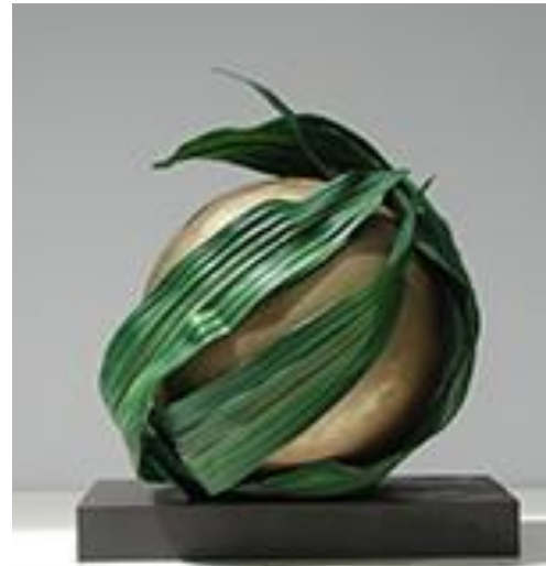
"Life Unfolding" Elizabeth McCue

This call for entry drew over 1700 images but juried in only 198 images. The book will include as many mediums and expressions of casting as possible. In addition to images of work and process, the authors will include thoughts straight from artists about how casting impacts, enhances or expands possibilities in their work. The authors have stated that they don't want the book to be filled with technical instruction but rather provide inspiration and thought provoking perspectives. The publication will also include five well-known essayists introducing various chapters in CAST.