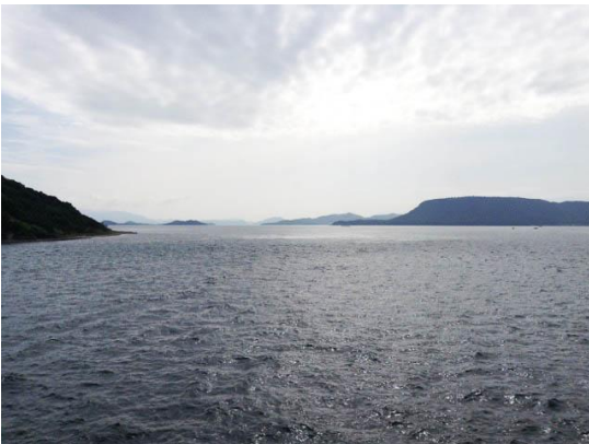
Ferry from Tatsumaka Port